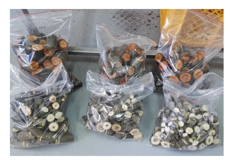
Fig. 1. Samples prepared for testing, in foreground black locust, on the second alder

There are many known friction measuring devices that differ in terms of how they measure and record results. This has an impact on the accuracy of the measurement and the obtained characteristics in the course of measurements, which is the basic criterion for choosing the measurement method. In the presented work to measure the external friction force of wood biomass chips, a station built on the basis of the MTS INSIGHT 2 testing machine with a measuring head 2000 N was used. The stand consisted of a horizontal base with a replaceable friction surface (e.g. steel plate) and a special measuring cassette measuring 300x300x300 mm, in which the material was moving along the surface under the test. The measuring cassette is equipped with a precise chassis, eliminating friction against the tested surfaces. Forcing the movement of the measuring cassette on the given surface is carried out thanks to the movement of the head of the testing machine. The material in the measuring cassette in subsequent tests was loaded with a force of 20 N, 40 N, 60 N, 80 N (using special weights).